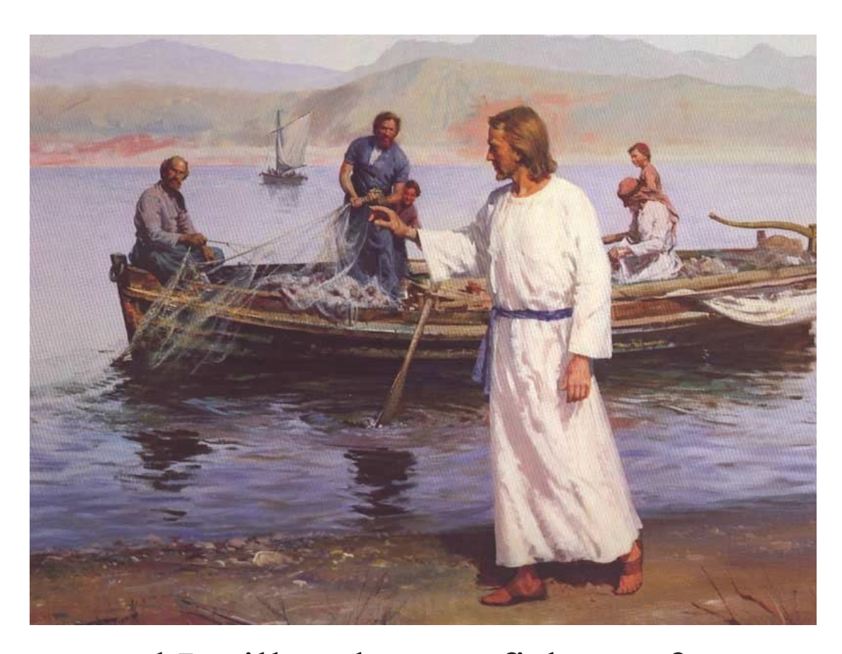
...and I will make you fishers of men.