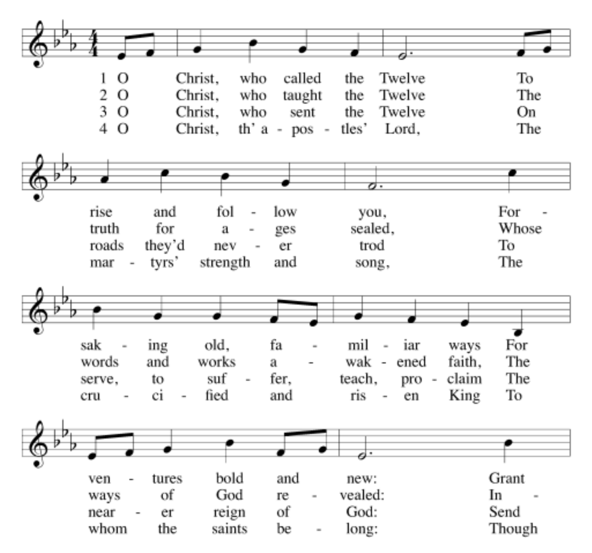
HYMN: #770 "O Christ, Who Called the Twelve"

<sup>5</sup>Jesus sent these twelve out and commanded them, "Do not go among the Gentiles, and do not enter any town of the Samaritans. <sup>6</sup>Go instead to the lost sheep of the house of Israel. <sup>7</sup>As you go, preach this message: 'The kingdom of heaven is near!' <sup>8</sup>Heal the sick. Raise the dead. Cleanse lepers. Drive out demons. Freely you have received; freely give.